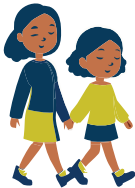
Screen-free time together