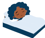
No screens at least 1 hour before bedtime