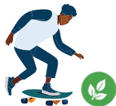
Stay active. More green time, less screen time